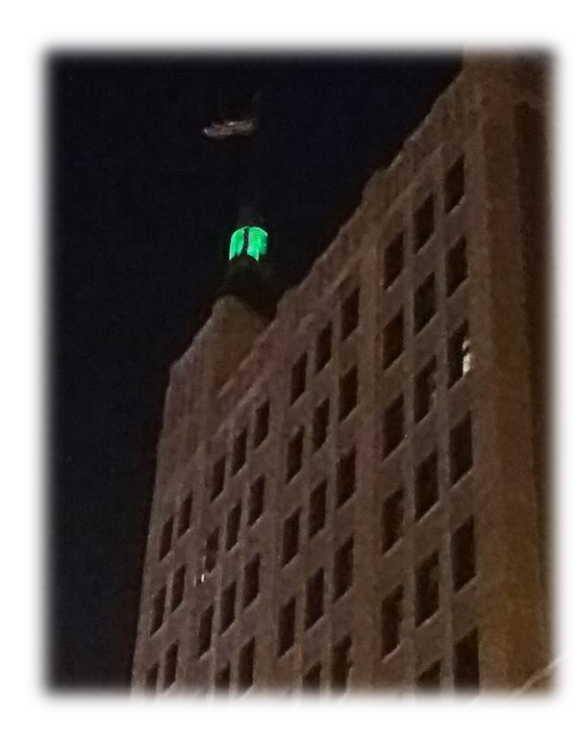
Robey Hotel in Chicago Lit Green for NRPM 2017