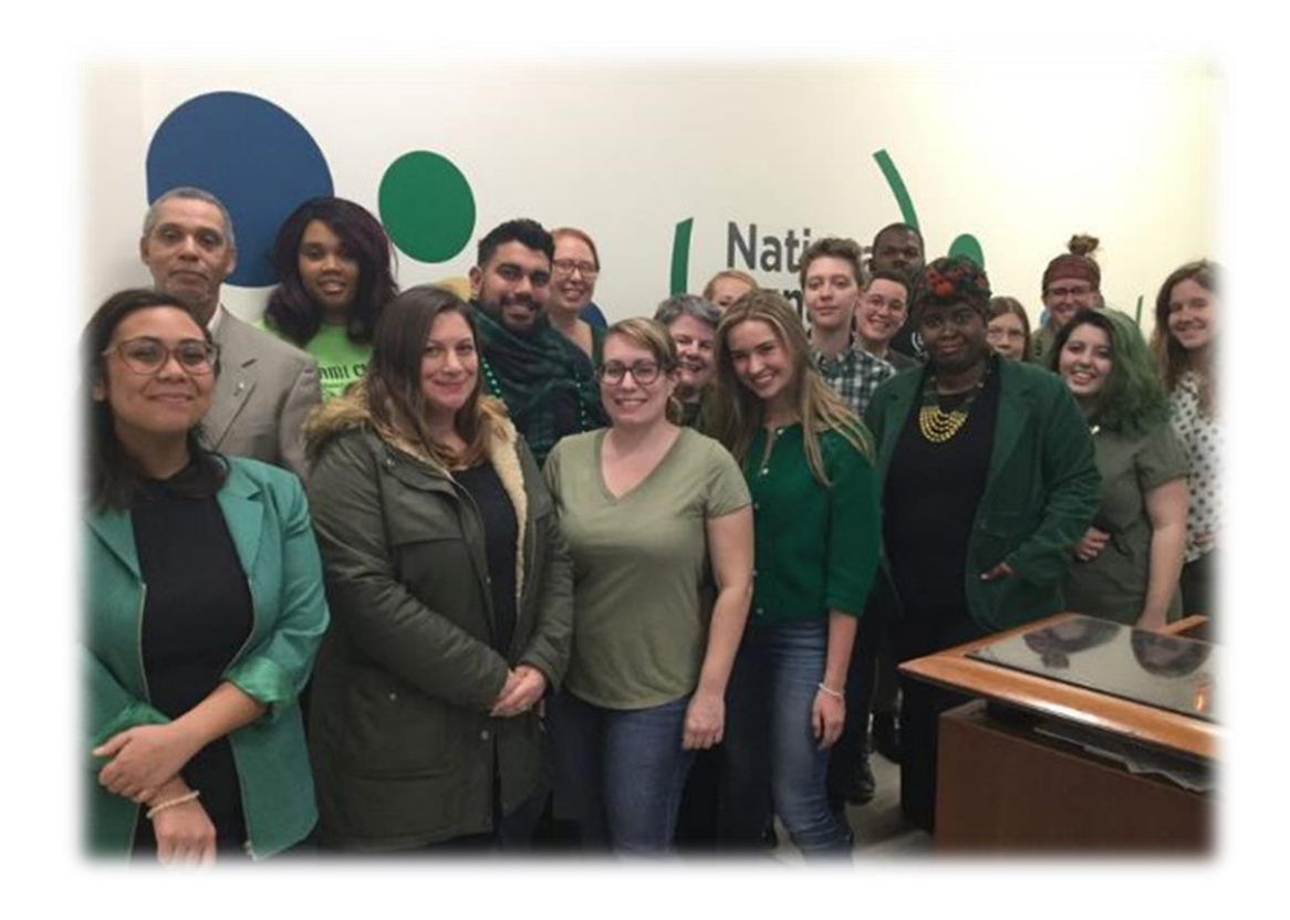
Staff at NRS wearing green in honor of 'wear green day' 2017

This toolkit is divided into four sections: ways to make a difference, events and activities, local fundraising, and getting the word out.