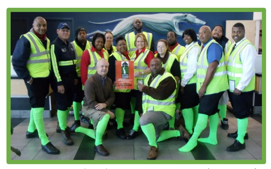
Our partners at Greyhound Lines, Inc. participating in 'Wear Green' Day

You can download the NRPM Activity Poster and share it with your local network. Please visit <u>1800RUNAWAY.org/nrpm</u> to download a FREE NRPM poster.